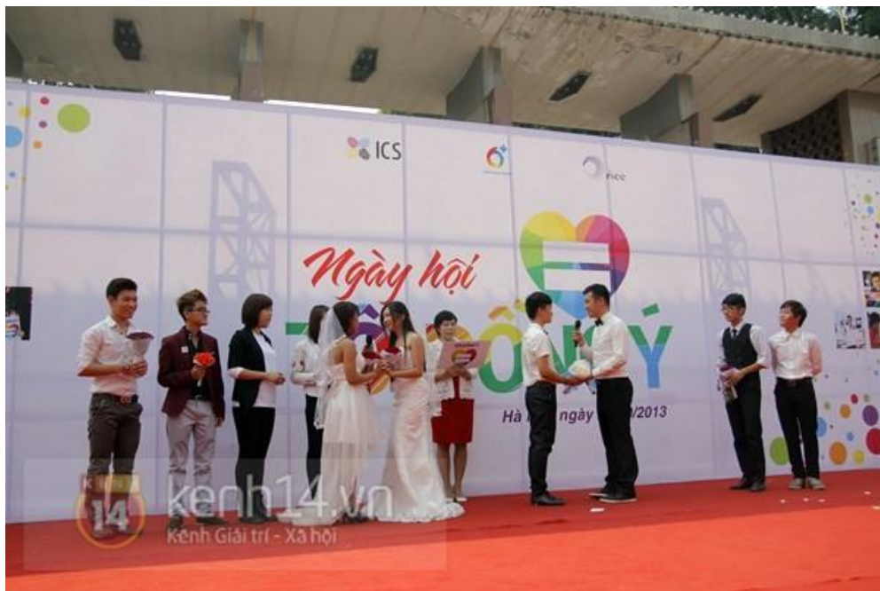
The 'I Do' festival at Thong Nhat Park in 2013.