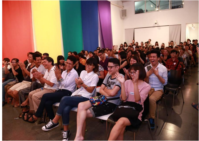
“Kịch tương tác với LGBTQ” (Interactive Theater with LGBTQ) event held at the Goethe-Institut in 2016 (Photo: Hanoi Pride).

For communication, raising awareness and reducing societal prejudice, events are often organized in the form of exhibitions, artistic performances, panel discussions, seminars, and festivals. The Goethe Institut is the venue where many artistic events and discussions about the lives of queer people take place, such as the exhibition "Pink Choice – Love is Love" by photographer Maika Elan (2013), the exhibition “Dưới ánh mặt trời” (Under the Sun) (2014), the art festival "Queer Forever!" (2015), or the panel discussion "Con tôi đặc biệt" (My Child is Special) (2016).