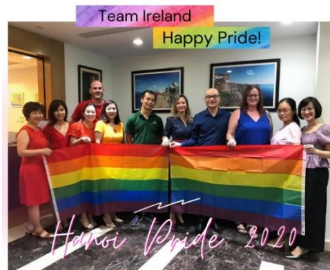
The Embassy of Ireland's staff celebrated Hanoi Pride 2020.