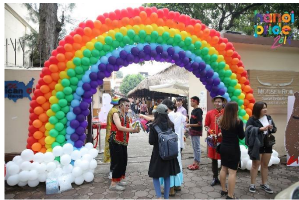
American Club is the iconic space where the largest annual LGBTIQ+ event in Hanoi took place – Hanoi Pride.