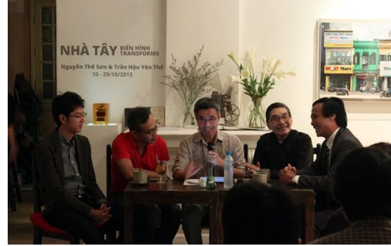
“Right or Wrong – Same-sex Marriage” talkshow at Manzi Art Space in 2013