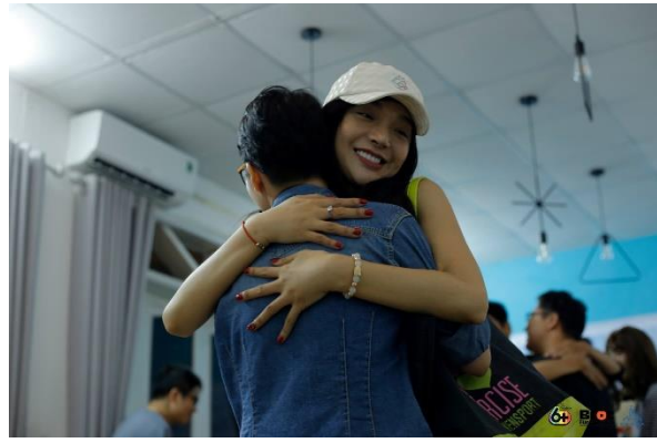
“Bước vào trong mình” workshop, held at Moonwork Coworking Space in 2018, aimed to share and heal mental barriers of transgender people