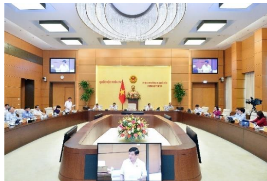
The Standing Committee of National Assembly provided feedback on the proposal to draft the Gender Affirmative Law in 2023 (Photo: Viet Nam National Assembly Portal).