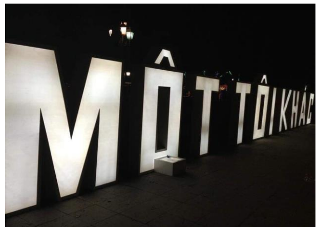
The exhibition “Một tôi khác” at Ly Thai To park in 2013.