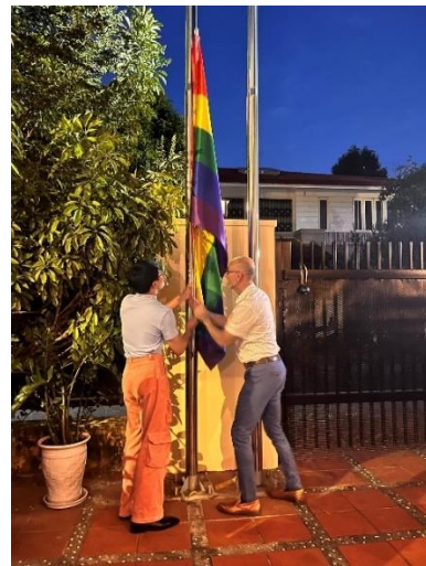
The Ambassador of Canada displayed the rainbow flag in celebration of Hanoi Pride 2023

For entertainment purposes, events are often organized in the form of free film screenings, bringing a variety of LGBTIQ-themed movies from countries in Southeast Asia, East Asia, and Europe to audience of different ages and genders. A notable example is the event "Chiếu phim điện ảnh và phim tài liệu về queer" (Screening of Queer Films and Documentaries) organized in 2022 at the residence of the Ambassador of the Netherlands by the Lighthouse Social Enterprise, LumiQueer, and Document Our History Now (DOHN).