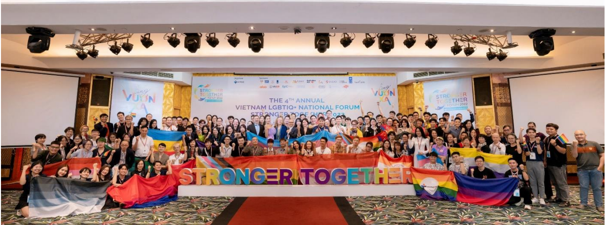
“Stronger Together Summit” is an annual event for organizations and community groups to discuss challenges and solutions to promote LGBTIQ+ rights. This photo was taken at Fortuna Hotel in 2022.

Regarding health-related topics, since 2016, sharing sessions and workshops focusing on physical, mental, and sexual health of transgender individuals (gender transition surgery, hormone usage, psychological barriers, etc.) have been initiated by community groups and organizations at LGBTIQ+ friendly cafes and co-working spaces. On a larger scale, panel discussions and seminars on health issues for the LGBTIQ+ community take place in conference rooms of hotels and co-working offices of community organizations. For example, events like the "Exchange with doctors from the World Professional Association for Transgender Health (WPATH)" (iSEE Hub, 2020) and the forum "Collaboration and actions to improve mental health for the LGBTIQ+ community in Vietnam" (Sen Grand Hotel and Spa, 2022).