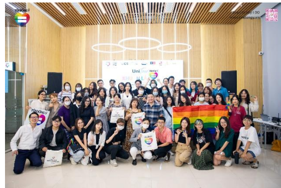
2022 I Do – UNI Tour at Swinburne University of Technology

In addition, events at educational spaces are mainly organized at university campuses, ranging from public universities such as Hanoi University of Science and Technology, University of Social Sciences and Humanities, National Economics University, to private universities like Vin University, and international schools such as BUW and RMIT (constituting 95.08%); and fewer events are held at high schools, specifically Viet Duc High School, Van Noi High School, and Olympia School (constituting 4.92%).