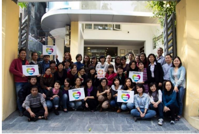
CARE in Vietnam showed support for "I Do" campaign in 2013.

During the period 2012-2015, events mainly focused on communicating and reducing societal prejudice and discrimination and to support the "I do" campaign – a communication campaign advocating for same-sex marriage in Vietnam. For example, CARE shared on Facebook in 2013: " All employees and officials of CARE organization in Vietnam have agreed! We do. We support. We act. We care. ".