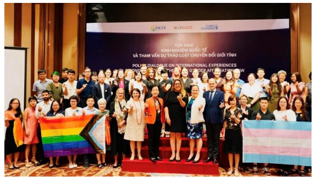
Policy dialogue on “International Experiences and Consultation on the Draft Gender Affirmation Law” at Foreign Relations Hotel in 2022.