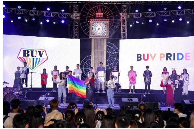
“Meet & Mingle 2022” at British University Vietnam

Only 2 events related to the law were organized in educational spaces as found by the survey team. Specifically, these events were the Seminar named “ Người chuyển giới trong Bộ Luật Dân sự sửa đổi năm 2015 ” ( Transgender Individuals in the Civil Code Amendment of 2015 ) held at the Trade Union University in 2015 and the Workshop on “ Pháp luật về chuyển đổi giới tính trên thế giới và kinh nghiệm cho Việt Nam ” ( The Legal Framework on Gender Transition Worldwide and Lessons for Vietnam ) at the Law Faculty of the National University in 2016. In the following years, the research group did not find any information about events related to laws or rights for the LGBTIQ+ community being organized in educational spaces.