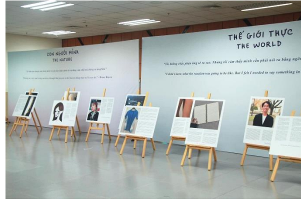
“Hai Thế giới” Exhibition at National Economic University in 2023