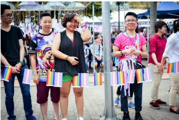
“Bubu Town” held at American Club in 2016 (Photo: iSEE).

Annual festivals such as ASEAN Pride (2013, 2014), Viet Pride (Hanoi Pride), or BUBU Town (2015-2018) are often held at the American Club due to its advantage as an open space. These events always attract many participants of all ages and genders, featuring various engaging activities such as booths, games, and music performances. Therefore, they become safe spaces for queer individuals to be present and effectively convey messages of celebrating diversity to the community. Additionally, the American Center and L’Espace were also venues for talks and discussions on LGBTIQ+ topics. For example, events like the film screening and discussion "Gender, Identity, and LGBT Rights" (L’Espace, 2018) or the discussion "Queer Hanoi, 1990-2020: Reflections on Emerging Identities" (American Center, 2020) took place in these spaces.