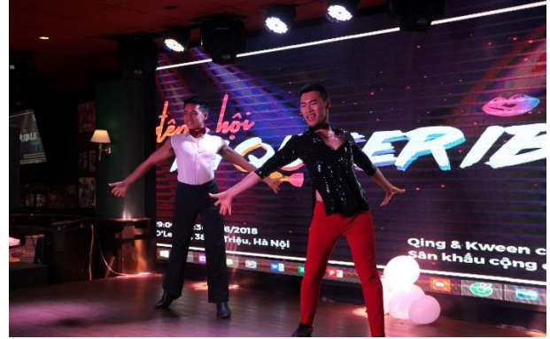
“Inqueerable Night” is the prom for LGBTIQ+ community, held at O’Learys Bar in 2018.

Community-building events organized at service businesses are often in the form of meetings, workshops, seminars, and discussions aimed at (i) enhancing knowledge and skills; (ii) identifying challenges and setting directions for activities related to LGBTIQ+; and (iii) connecting individuals, groups, and organizations working for the rights of LGBTIQ+ people. These events are typically held in meeting rooms and conference halls of hotels and co-working offices of community groups and organizations such as Queer Hub (Hà Nội Queer), iSEE Hub (iSEE Institute), or CEPEW Nest (CEPEW).