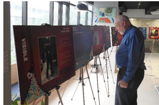
“INVISIBLE” exhibition at The Mahogany Core Space in 2018