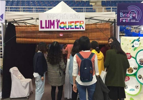
BridgeFest in 2019 at Quan Ngua Sports Complex.