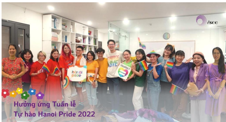
iSEE Institute's staff celebrated Hanoi Pride 2022

Regarding the event's purposes, 58.33% of activities related to LGBTIQ+ in these spaces typically aim to (1) communicate, raise awareness, and reduce societal prejudice (58.33%); discuss health issues (25%); and reduce workplace discrimination (16.7%).