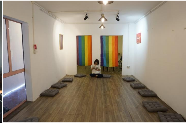
Queer Hub

Furthermore, the strong development of the internet and social media during this period has provided opportunities for individuals, groups, organizations, and institutions to share information about LGBTIQ+ events more widely.