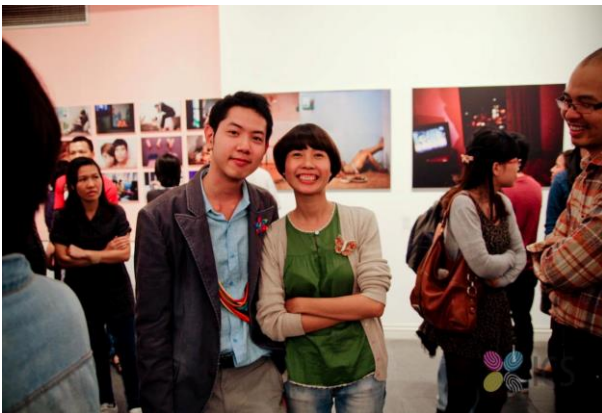
“Pink Choice” photo exhibition of Maika Elan at Goethe-Institut in 2013.

For communication, raising awareness and reducing societal prejudice, events are often organized in the form of exhibitions, artistic performances, panel discussions, seminars, and festivals. The Goethe Institut is the venue where many artistic events and discussions about the lives of queer people take place, such as the exhibition "Pink Choice – Love is Love" by photographer Maika Elan (2013), the exhibition “Dưới ánh mặt trời” (Under the Sun) (2014), the art festival "Queer Forever!" (2015), or the panel discussion "Con tôi đặc biệt" (My Child is Special) (2016).