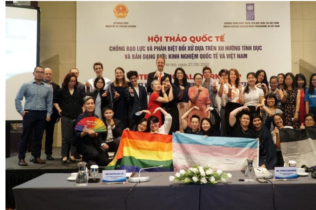
Seminar "Protection against violence and discrimination based on sexual orientation and gender identity: International and Viet Nam's experience" at Intercontinental Hotel in 2022.

For entertainment purposes, events held at service spaces are often organized in various forms such as community meetups, concerts, parties, and drag performances. These spaces began to be chosen as event venues by community groups starting in 2013 and have become increasingly popular in the past 7 years. Most activities take place at cafes and bars/clubs/lounges, creating safe and open spaces for queer individuals to socialize and interact. Notable examples include the "6'MAS Big Party" event (KANDY Club, 2013), the blind date "Blind date: Door of Love" (Jam Coffee, 2015), the LGBTIQ+ ball "Inqueerable Night" (O'Learys Bar, 2018), the music night "Trans Dot" (The HUT Lakeside Bar, 2022), and the drag performance "Gagapalooza" (Sidewalk Hanoi, 2019). Additionally, community groups often choose cafes as venues for regular themed gatherings and sharing sessions.