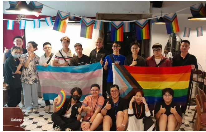
“Trans Talk 11” workshop, organized at G.O.K Coffee in 2023, created a sharing space for medical and sexual health issues for transgender people (Photo: IT’S T TIME).

Events related to law and rights of the LGBTQ+ community held in these spaces mainly took place during the period of 2012-2015. These were workshops, panel discussions, and training sessions aimed at advocating for the rights of queer individuals, focusing on two main topics: marriage equality rights and gender affirmation bill.