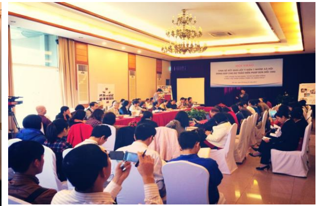
For the first time, the LGBTIQ+ community and 6 other social groups participated in providing feedback on human rights. Over 2.000 opinions were collected and directly submitted to National Assembly delegates. Venue: Army Guest House, 2013 (Photo: Huỳnh Minh Thảo).