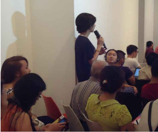
Workshop “Presentation of the UN’s 2013 National Report on LGBT” at Goethe-Institut in 2014.