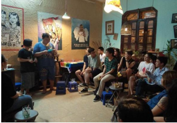
“Vén” workshop, held at Café Nhà Ấm in 2017, provided a safe space for LGBTIQ+ people to share about mental and sexual health