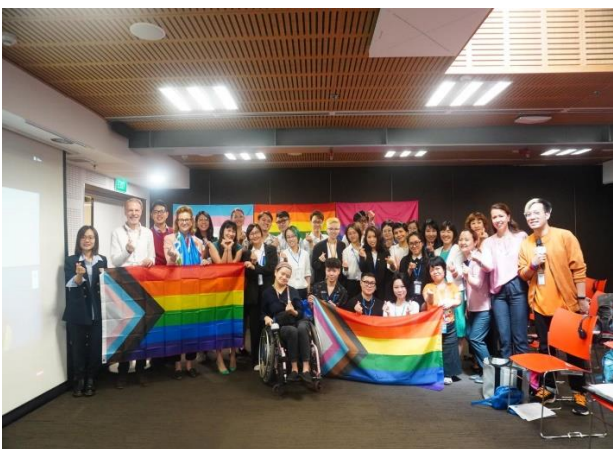
The community meeting and consulting on the "LGBTI Inclusion Index" in Green One UN House in 2022.

Two other events included the meeting with LGBTIQ+ community groups at the Green One UN House to consult on the "LGBTI Inclusion Index" and the study tour to exchange experiences in promoting gender equality in Vietnam. These activities were coordinated by UNDP in collaboration with diplomatic representative agencies and NGOs (iSEE Institute, CSAGA, UNICEF), aiming to build capacity for program officers and activists working on LGBTIQ+ rights.