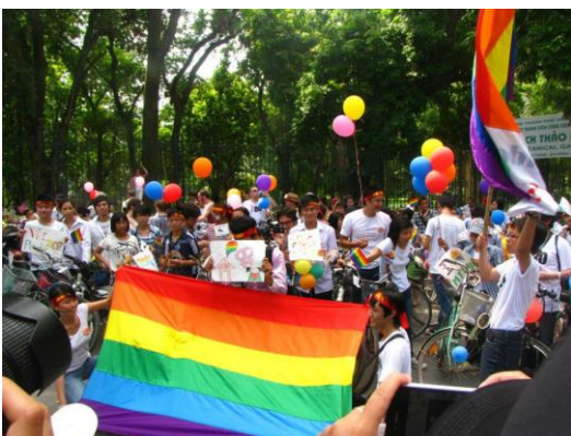
Viet Pride – First Pride 2012

The activities taking place in outdoor spaces attracted the attention of the media. For example, Vnexpress (2012) reported: “As part of the Viet Pride festival activities - the Vietnamese version of the Pride festival (celebrating diversity in sexual orientation, held annually in many countries), this morning over 200 people gathered at My Dinh Stadium to participate in a cycling event in support of the LGBTQ+ community. Among the 200 participants, about half are members of the LGBT community (homosexual, bisexual, and transgender individuals).” 7 Or Tuoi Tre Online (2012) reported: “More than 100 young people, dressed in youthful and colorful outfits, brought spontaneous dance moves for nearly 3 hours. Set to the music of 'Hair' and 'Born This Way,' - two famous songs in the LGBT community by Lady Gaga, with the message 'I just want to be myself.' The performance quickly attracted the attention of many bystanders in the central area, with many foreign guests eagerly joining the program. Many young people came from neighboring areas such as Quang Ninh and Hai Phong.” 8