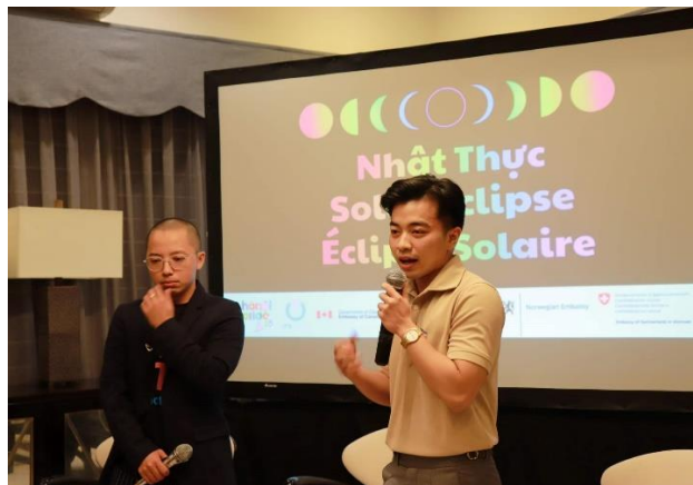
“Nhật thực” workshop held at the residence of the Ambassador of Canada in 2023