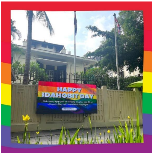
The rainbow flag displayed at the Ambassador of the UK's residence on IDAHOBIT day in 2023