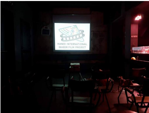
A film screening of the “Hanoi International Queer Film Week” in 2017 at Goethe-Institut.

For entertainment purposes, events related to the LGBTIQ+ community are often organized in the form of community film screenings and music festivals. Through music and film, the presence of LGBTIQ+ individuals is highlighted, either placed at the center or integrated into messages about diversity and equality.