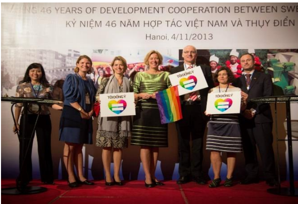
The representatives and staff of the Swedish International Development Cooperation Agency and the Swedish Embassy showed support for same-sex marriage in Vietnam in 2013.

For communication, raising awareness, and reducing social stigma/prejudice, these events are often organized by diplomatic representative agencies in collaboration with NGOs, organizations, and community groups in various forms: seminars, workshops, film festivals, participation in community campaigns and Pride Month, meetings with LGBTIQ+ organizations and groups, etc. A notable example is the participation of representatives from the Swedish International Development Cooperation Agency, the Swedish Embassy, and the British Embassy in the "I Do" (Tôi Đồng Ý) campaign for marriage equality (2013, 2014) organized by iSEE Institute and ICS Center. Additionally, on the International Day Against Homophobia, Transphobia, and Biphobia (IDAHOBIT) on May 17th and during the annual Pride Month, embassies of many countries such as the United States, the United Kingdom, Ireland, or Australia, fly the rainbow flag to show respect for diversity and openly express support for the LGBTIQ+ community.