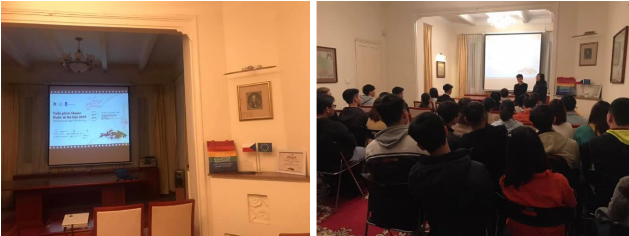
The film screening of “Hà Nội Queer Film Week” in 2019 at the Embassy of the Czech Republic.

the film week brought 34 independent queer films from 20 countries and territories around the world to audience.