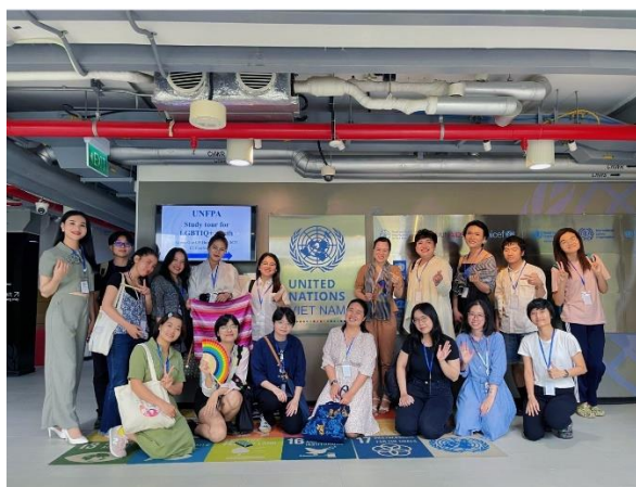
The study tour for LGBTIQ+ groups on the process of promoting gender equality in Vietnam in 2023.

Regarding discussions on legal issues and the rights of LGBTIQ+ individuals, workshops on this topic began to emerge in this space since 2016, specifically in a meeting between representatives from the Australian Embassy and community organizations in Vietnam at the Australian Embassy to acknowledge Vietnam's progress in protecting the rights of LGBTIQ+ individuals and areas where community improvements are still needed. At this time, discussions on the rights and presence of queer individuals have expanded and gained international attention.