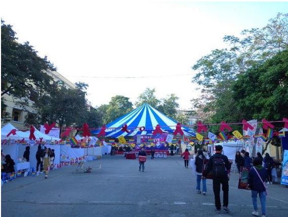
“STEP UP - Bắt sóng cảm xúc, Tận hưởng yêu thương” at National Economic University in 2019