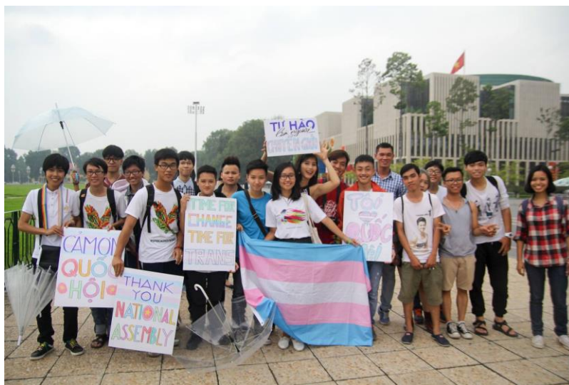
The event "Thank You National Assembly" in front of the National Assembly building in 2015.

According to the plan, Giang and everyone went to the bus station opposite Lenin Park to wait for the delegation to pass by. When the delegation passed, the whole group joyfully raised banners of gratitude to show their appreciation. Many delegates on the bus also looked towards us, perhaps they were also pleased to see strangers cheering on their legal advocacy journey."