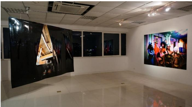
"heARTbreak!" exhibition at Nhà sàn Collective in 2015