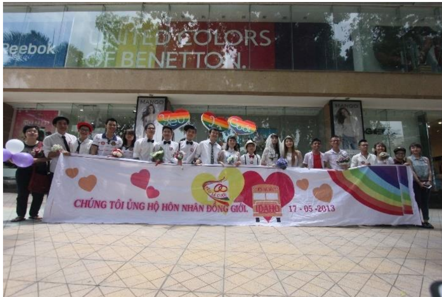
The collective wedding ceremony “Yêu là cưới” at Vincom Building in 2013 (Photo: Kenh 14).

The diverse range of events, including exhibitions, collective weddings, cycling parades, and more, has attracted the attention and participation of many people, raising their awareness of LGBTIQ+ issues.