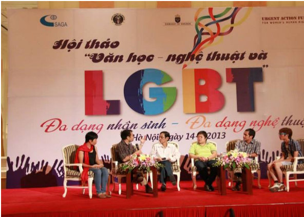
Workshop "Literature – Art and LGBT" held at Daewoo Hotel in 2013 with an aim to connect artists and queer people.

Meeting rooms and conference halls of accommodation service businesses are venues for many workshops, panel discussions, and exhibitions related to LGBTIQ+ on both small and large scales. These events often involve various stakeholders such as government agencies, diplomatic agencies, NGOs, individuals, organizations, and community groups. Examples include the workshop "Literature - Art and LGBT" (Daewoo Hotel, 2013), the talk show "Định kiến đến từ đâu" (Where Prejudice Comes From) (Sao Mai Hotel, 2017), the seminar "Sharing about SOGIESC and UNCRC" (Ministry of National Defense Guest House, 2018), and the seminar "Protection against violence and discrimination based on sexual orientation and gender identity: International and Viet Nam's experiences" (Intercontinental Hotel, 2022).