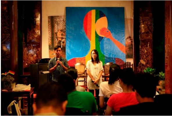
“Rainbows and Buttons” exhibition organized by Youth Orientation Vietnam to raise awareness about the LGBTIQ+ community at Le Cine café in 2014