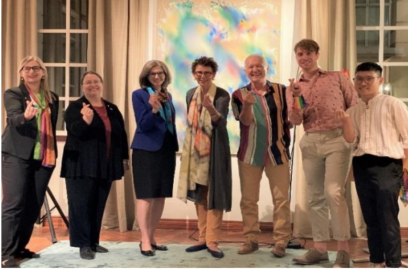
The opening ceremony of Hanoi Pride 2021 at the Ambassador of Norwegian's residence