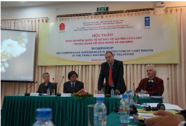
The first workshop organized by the Ministry of Justice on same-sex marriage at West Lake Guest House in 2012.