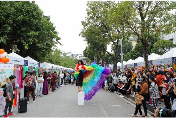
BridgeFest in 2020 at Hoan Kiem pedestrian street (photo: ECUE).