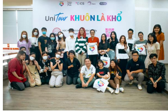
2022 I Do – UNI Tour at Academy of Journalism and Communication