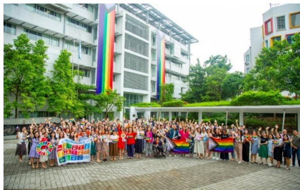
The United Nations in Vietnam's staff gathered in the Green One UN House to support Hanoi Pride 2022 (Photo: United Nations Viet Nam).