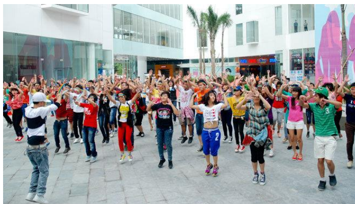
More than 100 young people performed a collective dance titled “Love is love” at Indochina Plaza, Cau Giay, Hanoi.

In the 31 events organized in public outdoor spaces, 22.58% of the events were held in 2013. 2013 was the year with the highest number of LGBTIQ+ events in these spaces. The highlight of this year was the launch of the "I Do" Campaign - a social communication campaign initiated by the Institute for Social,