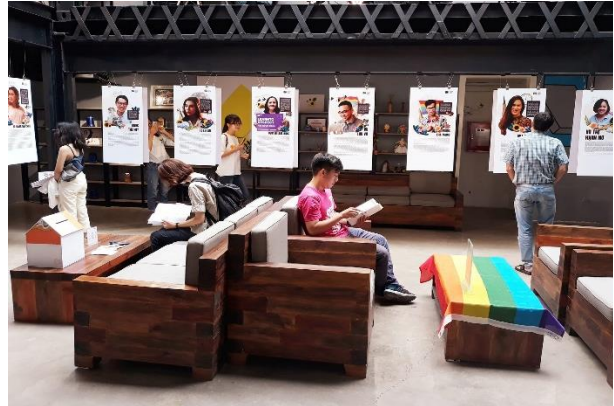
“Viet Nam Queer History Month” exhibition at Savage Lounge in 2018.