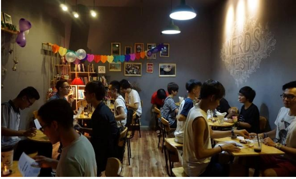
“Speed Dating” event for LGBTIQ+ community at The Nerd's Nest in 2016