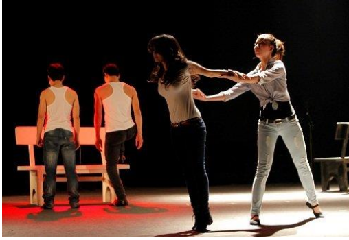
“Stereo woman – Aspiration to be Myself” play at the Youth Theatre in 2012