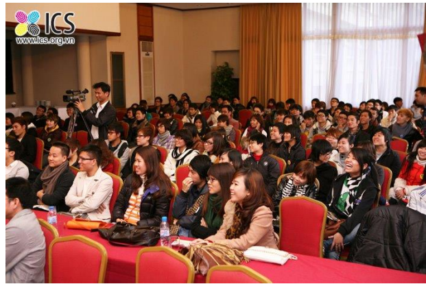
“I Heart Ha Noi” LGBTIQ+ community meeting organized by iSEE và ICS at Army Guest House in 2011.