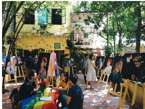
“Hầu đồng và Queer” exhibition at O Kìa Hà Nội in 2019 (Photo: Hà Nội Queer).