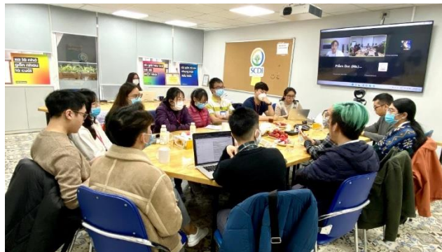
Meeting between resident doctors and the LGBTIQ+ community at the Centre for Supporting Community Development Initiatives (SCDI) in 2022

According to the survey, there are 12 workplaces where the LGBTIQ+ community is present, accounting for 2.73% of the total events. From 2012 to 2015, 4 out of 12 events were held in these spaces to support the "I do" campaign. From 2016 onwards, 8 out of 12 events took place in workspaces, with events focusing on a more diverse range of topics through various approaches.