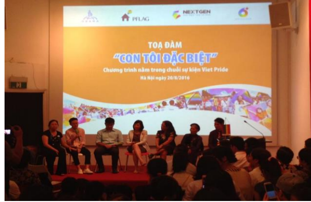
“Con tôi đặc biệt” panel discussion organized by CSAGA, PFLAG, NextGen and 6+ at Goethe-Institut in 2016.

Annual festivals such as ASEAN Pride (2013, 2014), Viet Pride (Hanoi Pride), or BUBU Town (2015-2018) are often held at the American Club due to its advantage as an open space. These events always attract many participants of all ages and genders, featuring various engaging activities such as booths, games, and music performances. Therefore, they become safe spaces for queer individuals to be present and effectively convey messages of celebrating diversity to the community. Additionally, the American Center and L’Espace were also venues for talks and discussions on LGBTIQ+ topics. For example, events like the film screening and discussion "Gender, Identity, and LGBT Rights" (L’Espace, 2018) or the discussion "Queer Hanoi, 1990-2020: Reflections on Emerging Identities" (American Center, 2020) took place in these spaces.