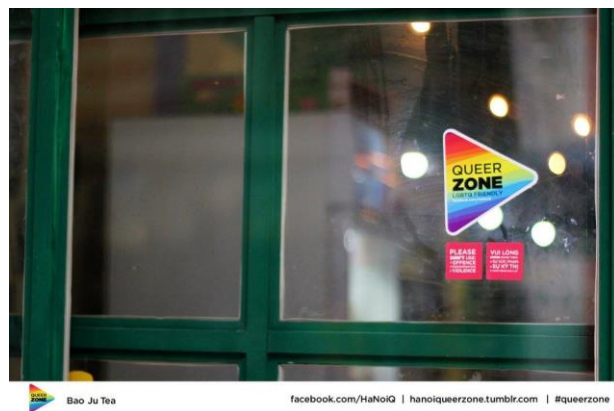
LGBTIQ+ friendly businesses have the “I Do” and “Queer Zone” stickers on their door.