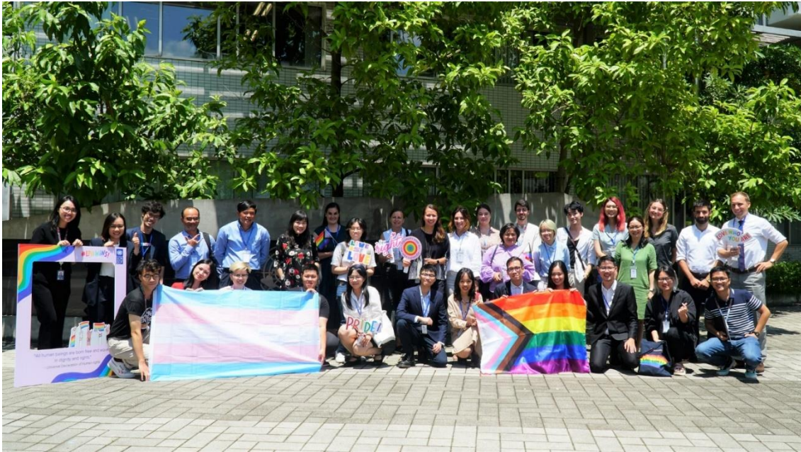
The consultation workshop on Preliminary Results of the LGBTI Inclusion Index in 2022 (Photo: Lighthouse Social Enterprise).

At the "Consultation Workshop on Preliminary Results of the LGBTI Inclusion Index" in 2022, representatives from diplomatic representative agencies, community organizations and groups shared and engaged in lively discussions about the results achieved after many years of social advocacy and rights movements. Vietnam became the only Southeast Asian country and one of the two countries in Asia to participate in the pilot phase of this index.