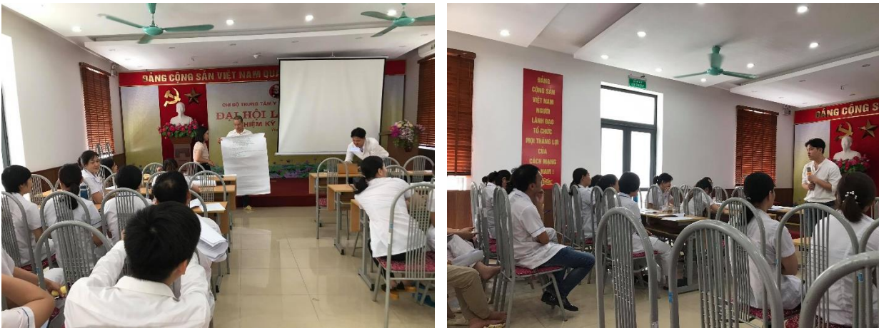
Healthcare staff of the Thanh Xuan District Health Center participated in the training in 2020 (Photo: Lighthouse Social Enterprise).

The only activity aimed at communication, raising awareness, and reducing societal prejudice that took place in this space was the training session “Nâng cao kiến thức và kỹ năng cho nhân viên y tế hướng tới môi trường y tế thân thiện với cộng đồng đích” (Enhancing knowledge and skills for healthcare staff towards a community-friendly healthcare environment) organized in 2020 at the Thanh Xuan District Health Center - a public sector entity under the Department of Health. The event was organized by the Lighthouse Social Enterprise, with the participation of 36 healthcare professionals and staff working at the Thanh Xuan District Health Center. The training aimed to (i) raise awareness among healthcare professionals about the LGBTIQ+ community; (ii) provide knowledge about gender and sexuality diversity, and (iii) practice principles of behavior, counseling, and delivering quality, friendly healthcare services to the target community.