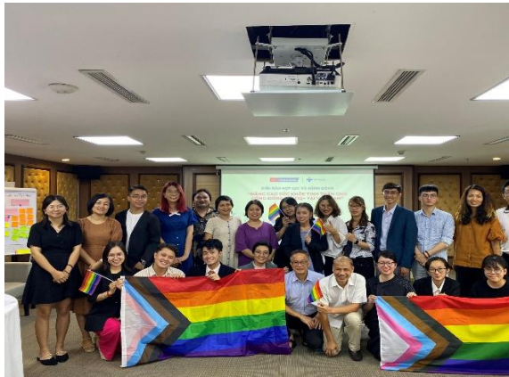
"Collaboration and actions to improve mental health for the LGBTQ+ community in Vietnam" forum at Sen Grand Hotel and Spa in 2022 (Photo: Lighthouse Social Enterprise).