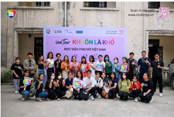
2022 I Do – UNI Tour at Vietnam Women's Institute