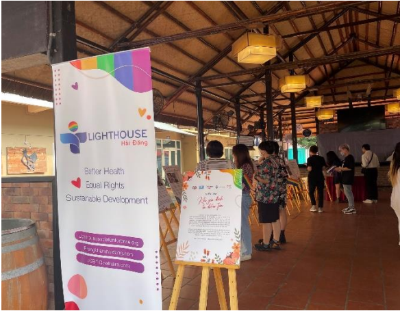
Photo exhibition “Khi gia đình là điểm tựa” (When Family Becomes the Fulcrum) at American Club in 2022

In terms of purposes, LGBTIQ+-related events organized at cultural exchange centers often focus on (1) communication and raising awareness (75.56%); entertainment (13.33%); discussions on rights and legal issues (4.44%); and (4) livelihood activities (2.22%).