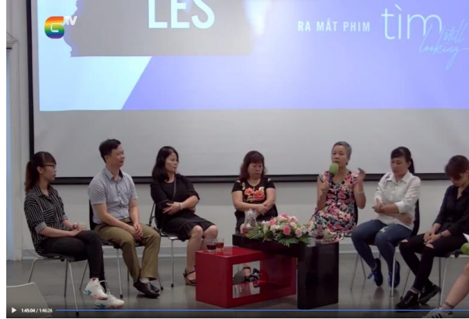
Panel discussion “Is Gay Marrying Lesbian the Perfect Solution?” hosted by CSAGA at Goethe-Institut in 2019.

There was only one activity related to the livelihood of queer individuals held at the cultural exchange center. It was the "Workshop on Leadership and Business Skills for LGBTI Community Members", organized by the American Center in 2016. The event aimed to inspire and open opportunities for life-changing experiences for queer individuals.