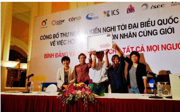
“Declaration Letter and Recommendations to the National Assembly on Legalizing Same-sex Marriage” workshop at Daewoo Hotel in 2013.