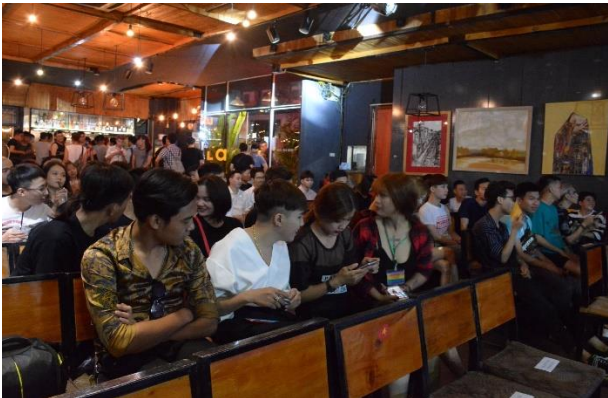
“Out and Proud Summer Party” celebrating Pride Month and promoting safe sex at LaCa café in 2018 (Photo: Lighthouse Social Enterprise).