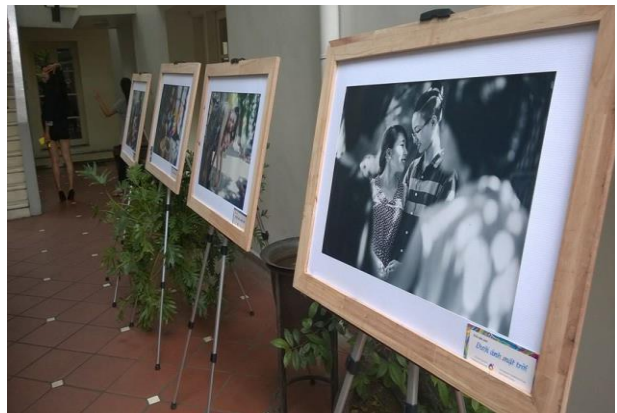
“Dưới ánh mặt trời” photo exhibition held at Goethe-Institut in 2014.